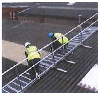
Picture 8 Staging with hand rail and safety line

Short lightweight boards spanning no more than three purlins are easier to move and will always provide a platform from which to move the one adjacent to it as work progresses if utilised correctly. Where a GRP sheet is used in conjunction with profiled spacers, sacrificial nets cannot be used. In the first instance, it must be confirmed that the replacement sheets are non-fragile. A safe system of work must be established and maintained. Due to the nature of the lightweight material being fitted crucial factors include the length of roof slope and pitch as the GRP is not designed to be walked on without crawling boards. It is therefore recommended that the crawling boards are positioned either side of the leading edge to prevent damage to the new sheets and protect against falls through the fragile asbestos cement sheets. See picture 9 below .