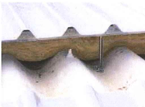
Picture 2 Bar & bracket with sheet and insulation