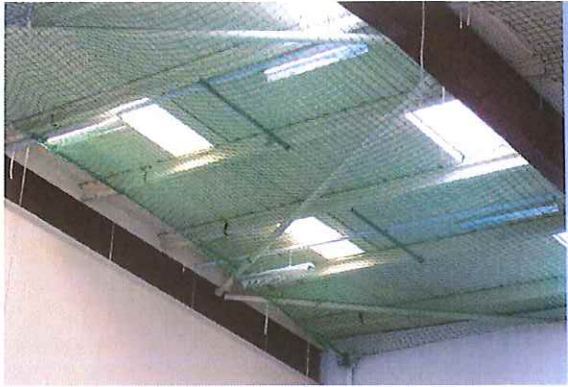
Picture 5 Close hung internal safety nets

the safety net when arresting a persons fall. See pictures 5 & 6 below.