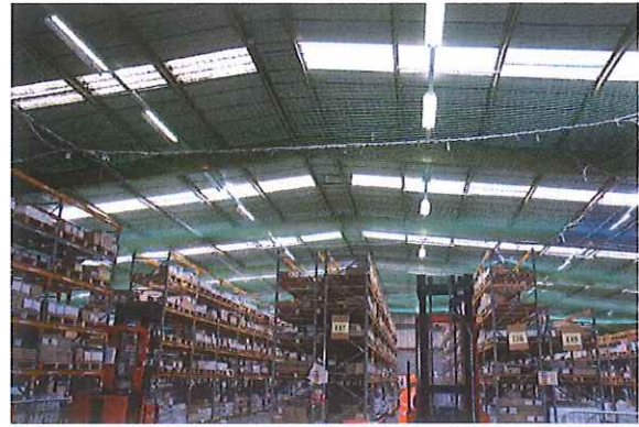
Picture 6 Racking that could interfere with the net

It should be noted that safety nets will not relieve the contractor from his duty to minimise the risk of falls through the existing fragile roof during the over roofing-work and crawling boards or similar items of equipment must be used if operatives need to traverse the existing fragile roof.