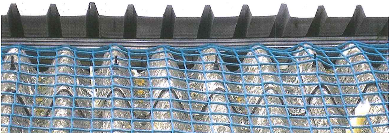
Picture 7 Sacrificial safety nets

Safety nets for all applications must be installed by trained and competent installers in a manner that does not pose additional risks to the installer or building occupants.