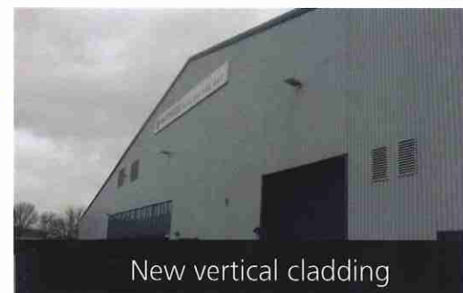
New vertical cladding