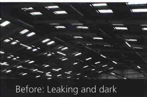
Before: Leaking and dark