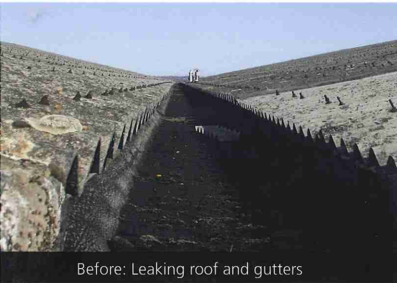
Before: Leaking roof and gutters